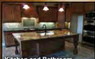
Kitchen and Bathroom Remodels