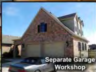
Separate Garage Workshop

TX State Licensed Remodeler & Home Builder