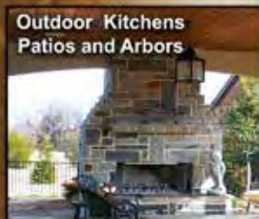
Outdoor Kitchens Patios and Arbors